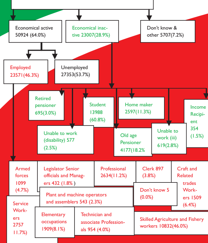
Economically Activity status of population aged 15years old and above in Kavango East, 2011 Census (79638)